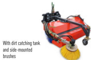
With dirt catching tank and side-mounted brushes

Sweeping machine with dirt catching tank and hydraulic drainage or without tank. On demand also available with snow brush roller (suitable for greenery), water tank with spray nozzles and side-mounted brushes, hydraulic side adjustment (incl. selection valve). Different brush diameters possible: 520 mm / 600 mm / 700 mm