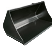
Soil bucket round for compact loaders

Strong soil bucket for heavy loads and earthworks, optionally available with ripper prongs, overflow protection and reversible knife.