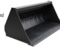
Soil bucket round for wheel- and telescopic loaders