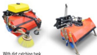
With dirt catching tank, water tank, spray nozzles and side-mounted brushes